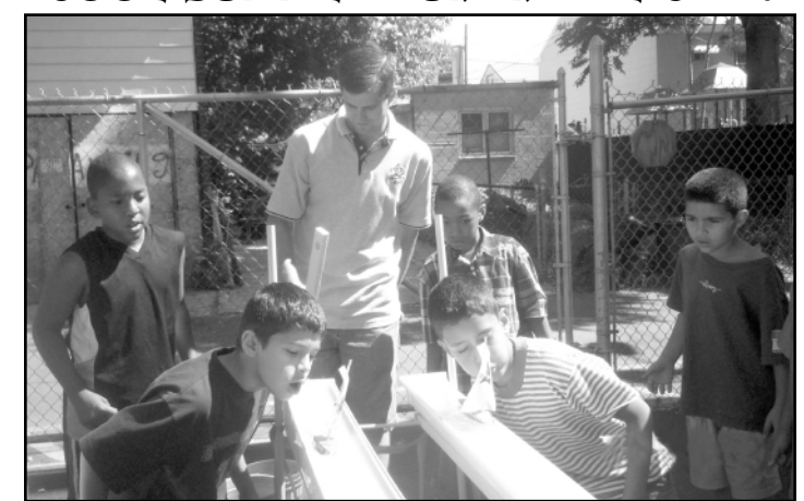
Campers of Cub Scout Pack 920 from the CYO Summer REC Camp participate in The "Rain Gutter Regatta".