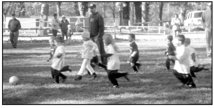
Players chase the ball during action for the New CYO Yardville Soccer League.

We would like to thank our Soccer League sponsors; The Flooring Craftsmen; Nini Plumbing; Security Dynamics; and EMR Contracting.