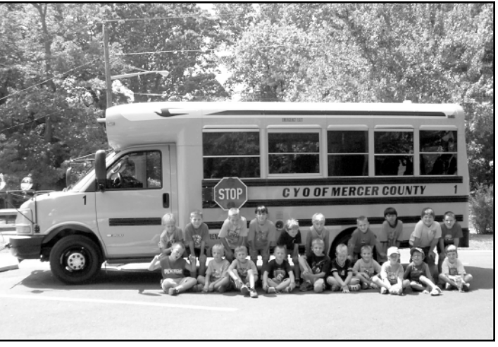
CYO Campers pose in front of the new Mini-Bus purchased by the CYO through the Grant from Kraft Foods.

The Kraft Employee Fund Northeast is a workplace-giving program supported by contributions from Kraft employees across the Northeast area. Kraft Foods, in showing its support, makes annual financial contributions to the Fund, and absorbs 100% of its administrative costs. The KEF 2006 grant program awarded more than $776,000 to twenty-four community benefit organizations, including CYO, in the focus areas of Elder Services, Healthy Lifestyles, Hunger & Youth Development.