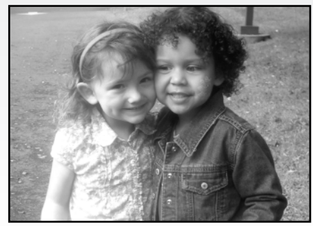
Friends enjoying the Fall Festival.

Plans for next year's Fall Festival are already in progress. It is tentatively scheduled for Sunday, September 30, 2007. For more information contact Kara DeBonis at 609-585-4280.