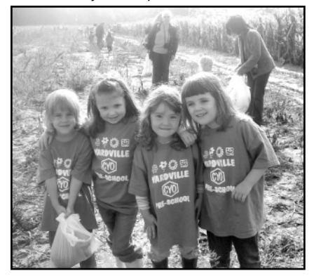
Yardville Pre-School students take a minute to pose for a picture during a recent field trip to Windsor Farms for Pumpkin picking and a hayride.

This is going to be another great school year!