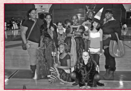
Students from the Trenton After School Program take a minute to gather for photos before the Halloween parade in the CYO Center gymnasium.