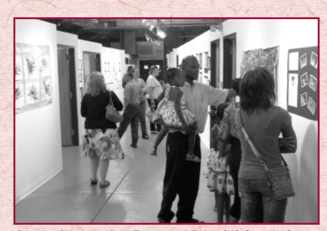
Parents of campers from Trenton and Ewing CYO Summer Camps stroll through the gallery at Art Works checking out the work that their children did this past Summer. The kids' artwork was displayed in the Art Works Community Gallery for the entire month of August.