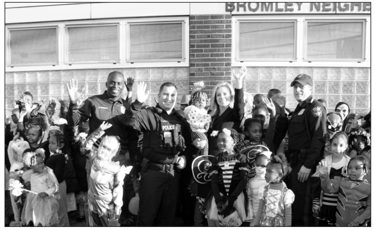
Parade participants, police officers, and Mayor Kelly Yaede pose for a picture in front of the Bromley Center after the Halloween parade.