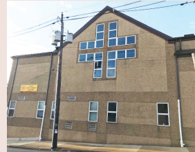
East State Street Center 794 East State St., Trenton (609) 989-8143