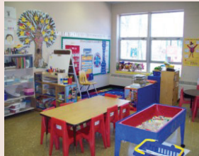
Ewing CYO 320 Hollowbrook Dr., Ewing (609) 883-1560