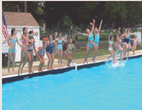
Yardville Branch 453 Yardville-Allentown Rd., Hamilton (609) 585-4280