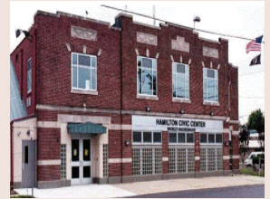
CYO Bromley Center 1801 East State St., Hamilton (609) 587-8100

Before & After School Programs located at four Hamilton Township Schools: Klockner, Greenwood, Wilson & Lalor.