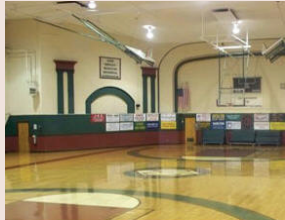
S. Broad Street Center 920 S Broad St., Trenton (609) 396-8383

Catholic Youth Organization (CYO) of Mercer County is an independently incorporated 501(c) (3), community organization, whose mission is to enhance the lives of Greater Mercer County youth and their families, by providing affordable, quality educational and recreational services, which include pre-schools, before and after school programs, summer camps, teen programs, swim lessons, and youth athletic leagues. Rooted in Catholic Tradition, CYO provides services in an inclusive, non-discriminatory manner, respecting the culture and faith of all. Initiated in 1952 by the Diocese of Trenton primarily to provide recreational activities for Catholic youth, CYO was formally incorporated in 1961, and has evolved into a full service childcare, youth development program provider, and social service agency.